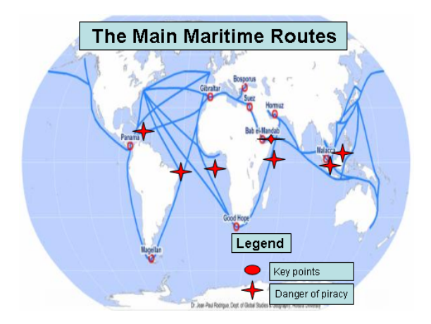
Fig. 2: The main maritime routes of the World

be passable freely and securely. It is not accidental that the piracy is gained strength near these areas.