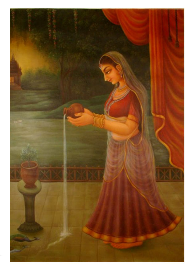
Fig. 6 Sacred Basil

6.5 Human Dignity in Indian Philosophies. The comparable term to human dignity of the West is explicit in the secular as well as religious philosophies of India. Indian philosophies perceive life to be sacred. In other words, not only human beings but also every life from animals to plants to microbes is divine in nature.