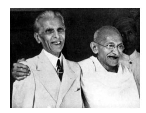
Fig. 3. Gandhi and Jinnah in Bombay, September 1944.

The biggest problem for socio-political-religious leaders is to gain trust of all the diverse ethnic groups of their society. Though Gandhi tried to serve the public by carrying out a moral duty of attaining freedom by the use of noble and peaceful means, he was assassinated on 30 January 1948.