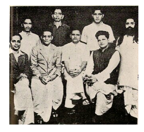
Fig. 4. A group photo of people accused in Gandhi's murder.