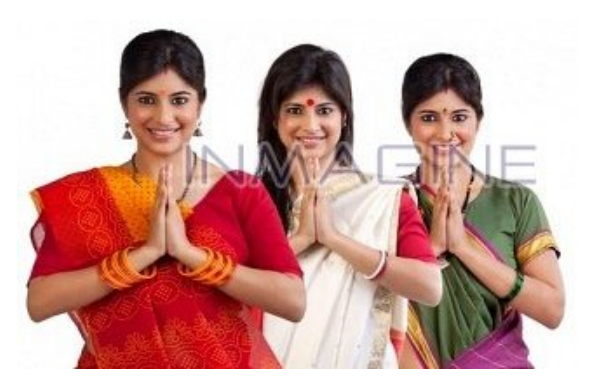
Fig. 1. Women greeting: namaskār/namaste "I bow down to the divine in you."

is personal and significant to them. The result is a diverse array of local religious customs and practices that are unique and meaningful to specific local cultures and communities. In addition, the universal non-violent and peaceful tenets of Hinduism allow for the cultivation of mutual respect and peace among practitioners of various sects as well as other religions, which furthers the inherent notions of human dignity.