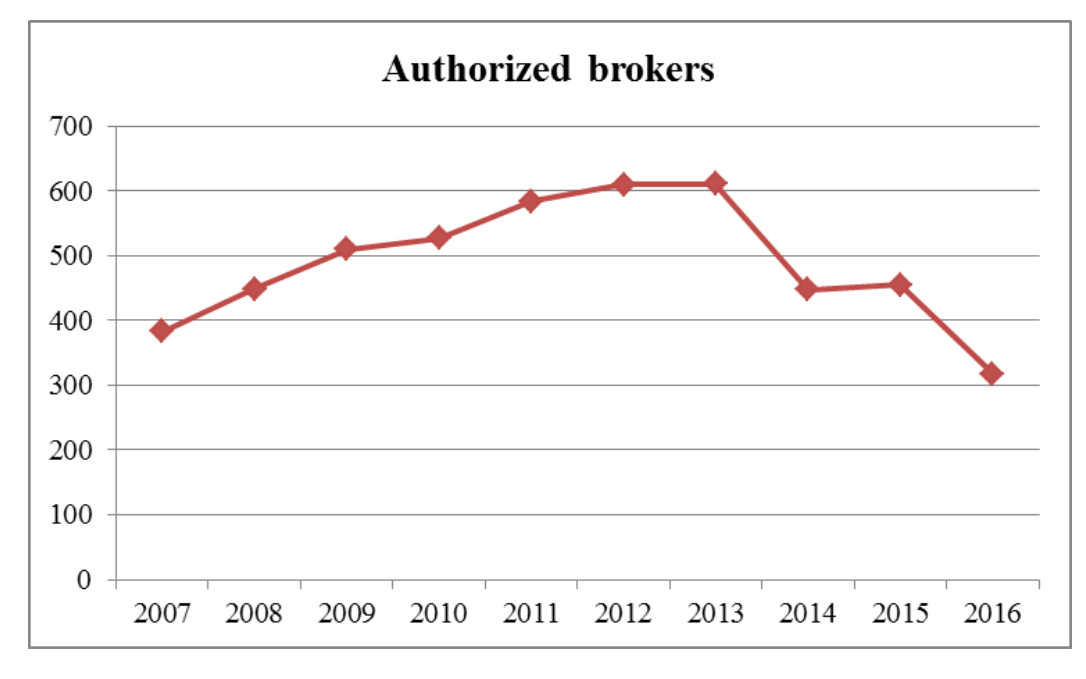
FIG. 1 "Authorized brokers"