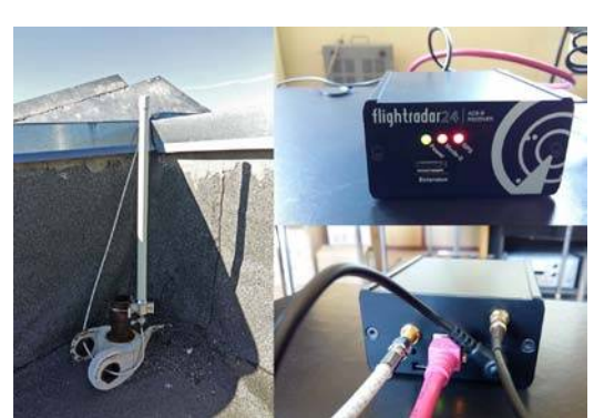
FIG. 3. Specialized equipment to monitor aircraft in real time