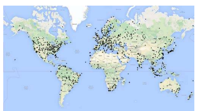
FIG. 2. Map of receivers activated in January-June 2015 [7]

The connections between elements is given on Fig. 4.