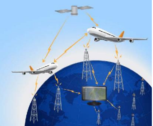
FIG.1. Gathering data in the project Flightradar24 [4]