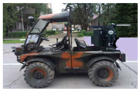
Fig. 1.3 A Combat Mobile Cell Against Low Altitude Targets (concept)