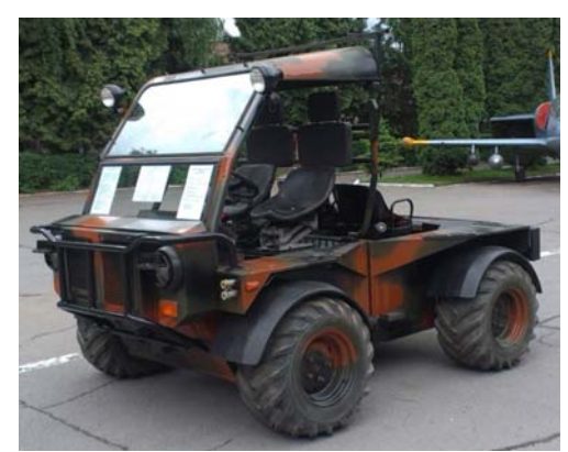
Fig. 2.1 The light off-road articulated vehicle DAC 2.65 FAEG

A light off-road articulated vehicle is a vehicle with a maximum weight of less than three tones and consisting of two equal vats connected to each other through a central pivoting bearing which allows moving both parts around the vehicle longitudinal central axis (Figure 2.1). [1]