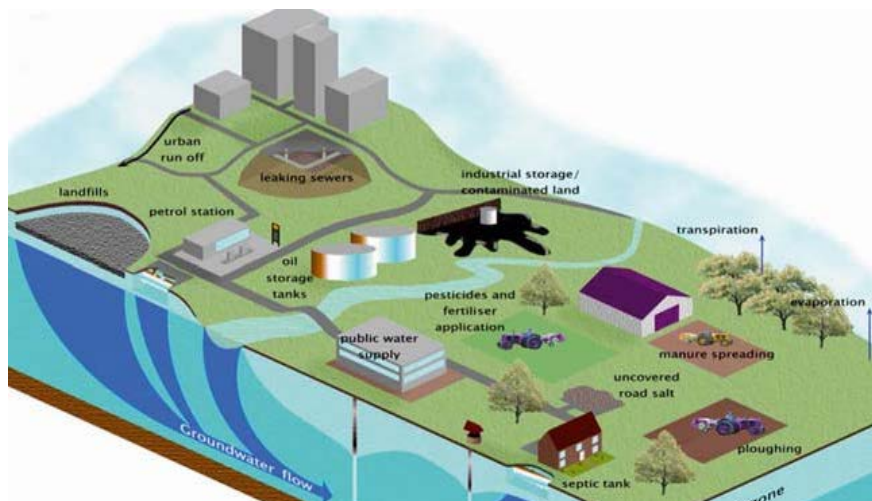
FIG. 1. The distribution of the main sources of pollution in soils with less sensitive use [2]

Sensitive soils include all types of soils in residential and recreational areas, soils used for agricultural purposes and soils in underdeveloped areas. Less sensitive soils include all commercial and industrial types of soils and land areas that will be in use in the near future. Less polluting sources of pollution, including those generating oil pollution, are encountered at the level of less sensitive soils (see Fig. 1).