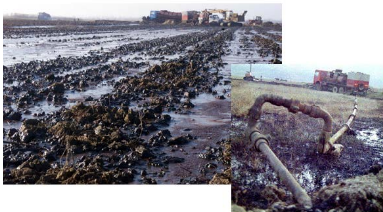
FIG. 4. An example of technology involving the removal of excess pollutant (petroleum)

In addition to the technology of removing excess pollutants (see Fig. 4), it is necessary for the soil-removal technology, which is considered to be complex, as a result of financial and technological investments, the application of pumping depollution technology. This is used for the decontamination of soils contaminated with hydrocarbons floating at the interface between the saturated area and the unsaturated zone. It is also possible to call for hydraulic blocking, which involves stopping the migration of pollutants by installing water wells or wells, below the contaminated area and exhausting the water outdoors. If the depolar has consistent resources, we also consider the excavation to be auspicious.