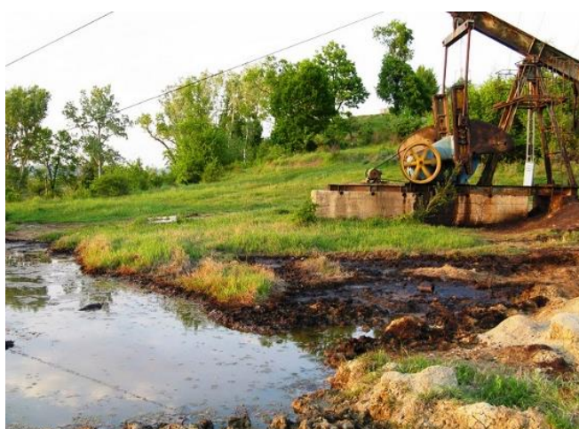
FIG. 2. An example of an unwanted accident causing soil pollution with petroleum products

The profile distribution of the pollutant is dependent, in the vast majority of cases, on the quantity and characteristics of the pollutant, the configuration and characteristics of the soil and the residence time of the pollutant. In soils with poorly permeable or waterproof horizons, a pollutant concentration zone appears above (see Fig. 2), because by its polydisperse body properties, the soil acts as a chromatographic column.